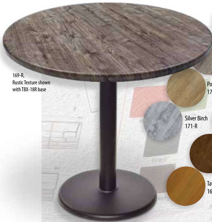
169-R, Rustic Texture shown with TBX-18R base

Our DesignChoice tops will enhance any interior, and last for years!